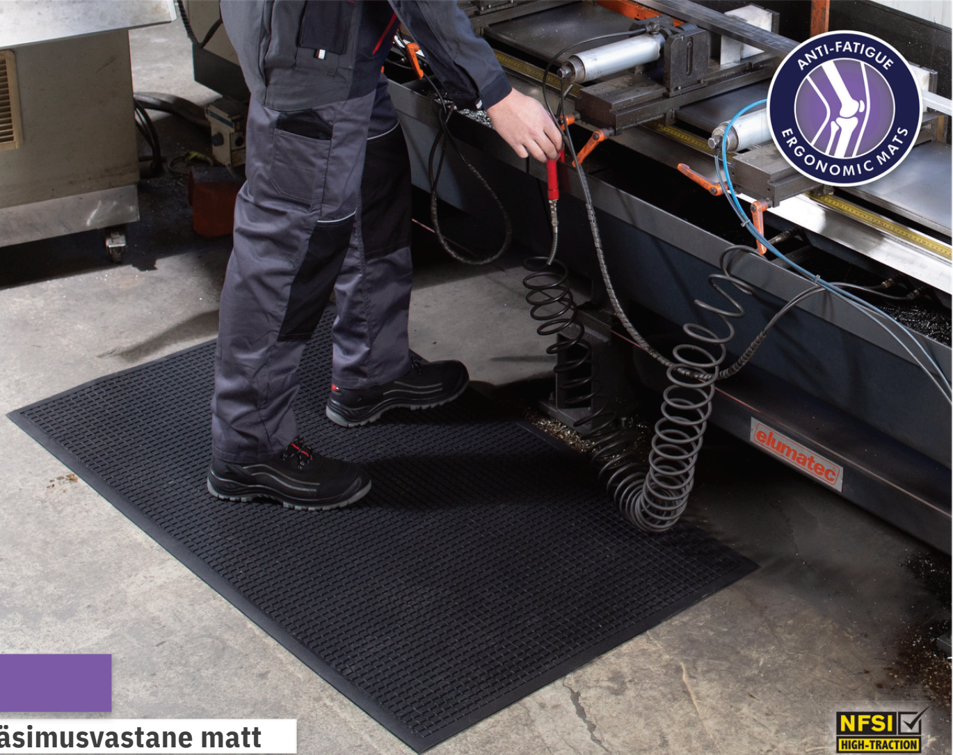
Baltic Väsimusvastane matt